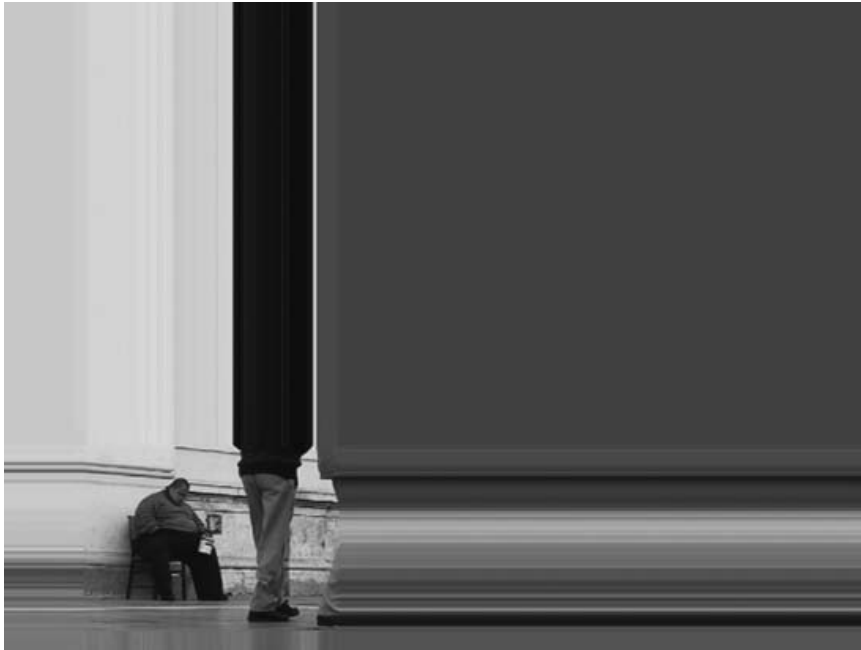
FIGURE 2.1 Jorge Castro, Witness (still), 2006. Reproduced with permission of the artist

out of frame. This gives the impression that there has been an augmentation to the digital signal, a mistranslation from the code of the computer to the image on the screen. A distinctly digital aesthetic is created here as the generative qualities and idiosyncrasies of an error make obvious the processes of the computer.